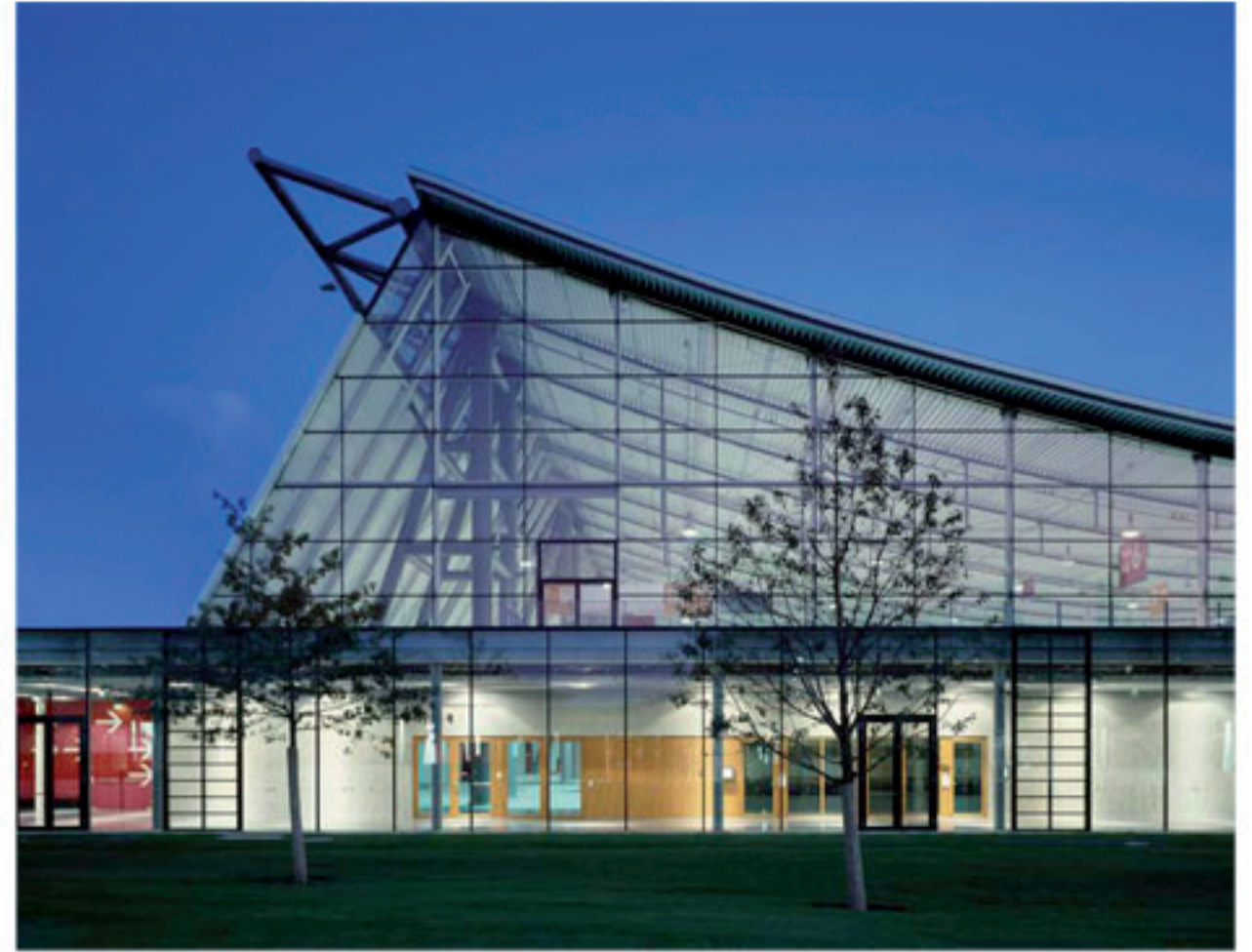
New Trade Fair in Stuttgart

Business plan: opening of a branch office in Melbourne Periodical client – user meetings. Computer assisted open planning strategy sizing suggestions and impulses of all involved parties. All work stages and architects services are effected by our office wulf & partner.