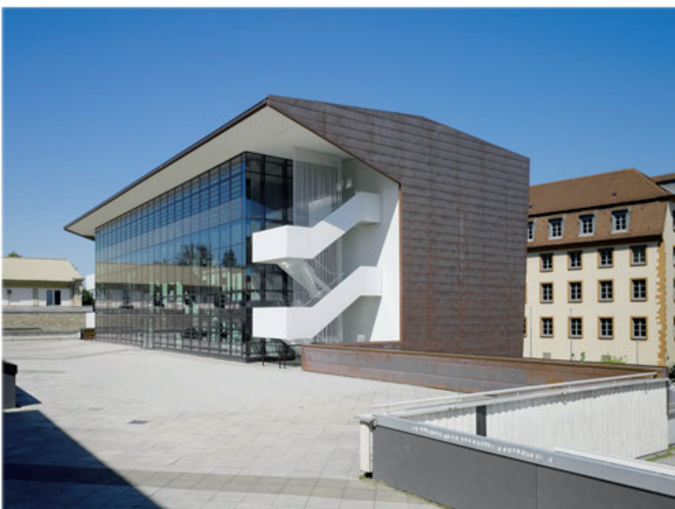
Deutschhaus-Gymnasium in Würzburg