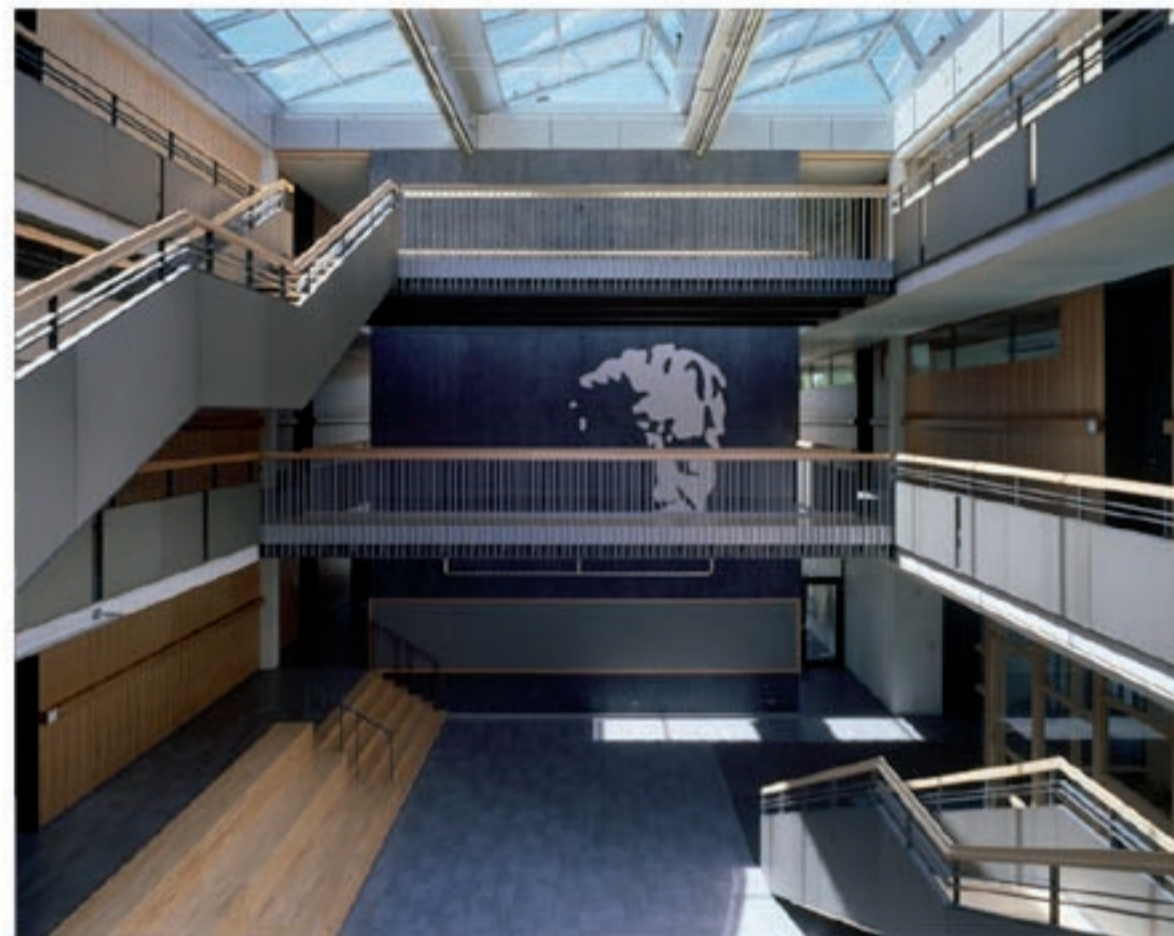
Albert-Schweitzer-High School in Laichingen, Germany

Creative work is the balance between absolute concentration and open minded communication