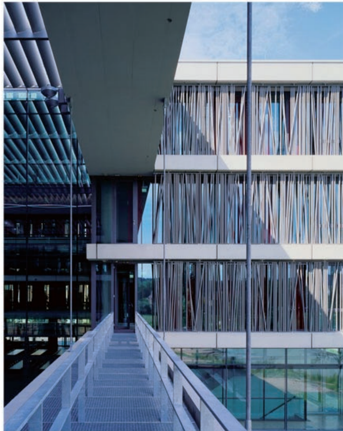
Schwenninger BKK Headquarters,

Nature provides human needs. Sustainability is collaboration with nature.