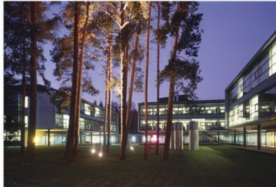
Research Building Complex in Erlangen,

There should be no contradiction between flexibility and inspiring atmosphere